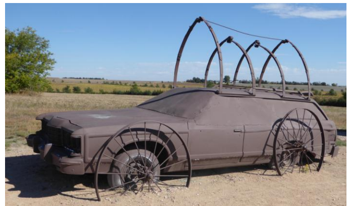
The "Covered Wagon"