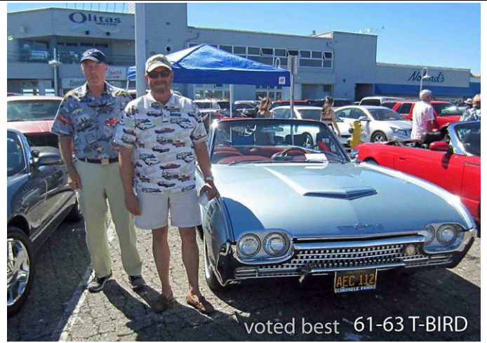
voted best 61-63 T-BIRD