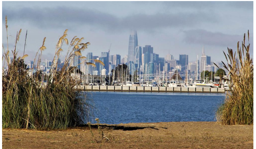
View of San Francisco from Migration 2018. Thanks again Tim!