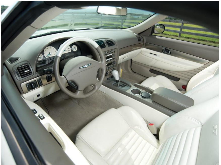
2005 50 th Anniversary interior with Cashmere exterior. 1500 production