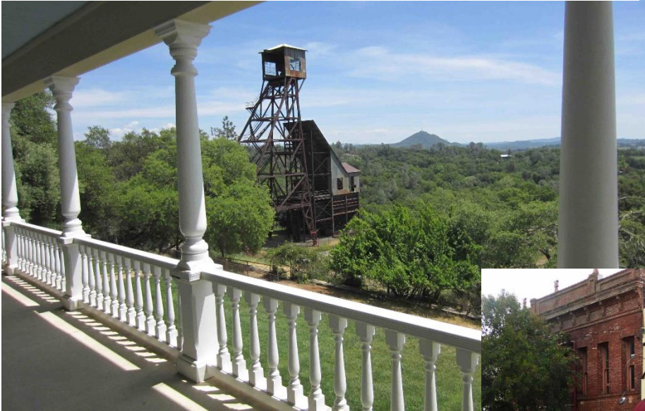
View from the mine office