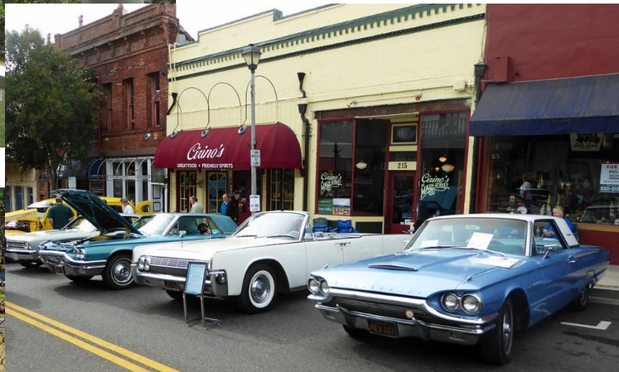
Beautiful cars and a great setting.