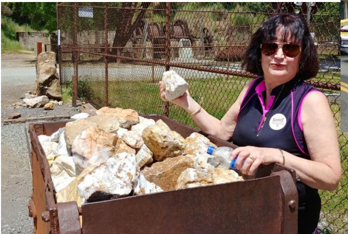
Sample of leavitrinite.....as in leave it right there!