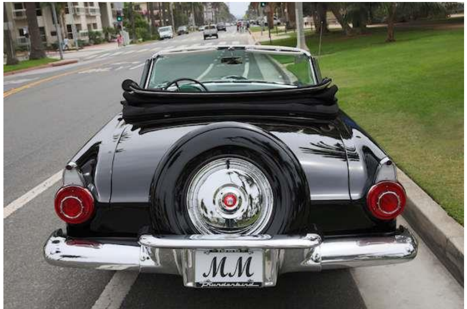
Marilyn Monroe's Thunderbird recent sold at auction for $425,000

INSIDE FLIGHT LOG 1 OAKLAND AIR MUSEUM UPCOMING MARCH 17 TH OAKLAND AIR MUSEUM MARCH 23 RD DAY AT THE RACES APRIL 13 TH SONOMA TOUR