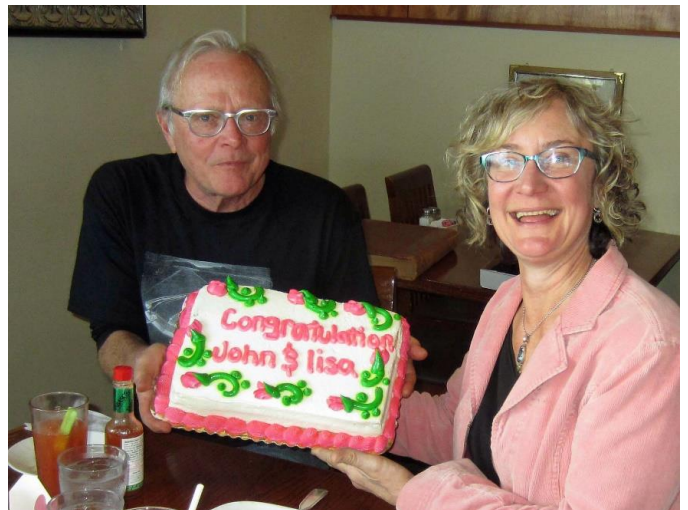
Our newly weds