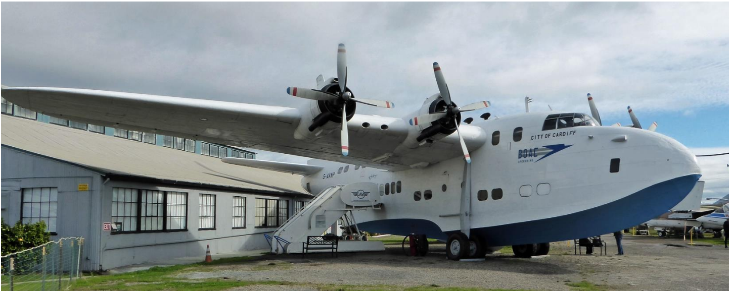
Short Solent MK111 as seen in Indiana Jones movie