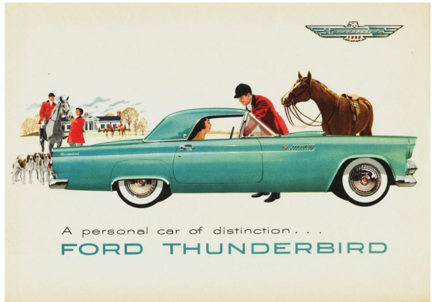
Early 1955 Thunderbird Ad

INSIDE FLIGHT LOG – TREE TRIMMING HOLIDAY LUNCHEON UPCOMING SWEETHEART / RARE PARTS TOUR DAY AT THE RACES