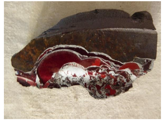
Raw Fordite as shown in last month's Wing

Previous to the advent of automated spray painting, spray paint would build up on the walls, tracks and car racks in the paint booth. Over time this overspray paint collected and would get thick on the surrounding items and had to be scraped or knocked off to keep the plant clean.