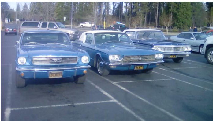
Family of Fine Cars at Grass Valley's Cars & Coffee