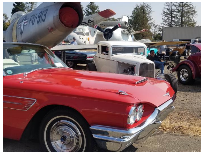
Brian Ahern's '65 Convertible

This aircraft flew out of Coast Guard Air Station San Francisco at SFO, and was one of the first in the PCAM inventory. Albatross seaplanes were in Coast Guard service 1951-1983.