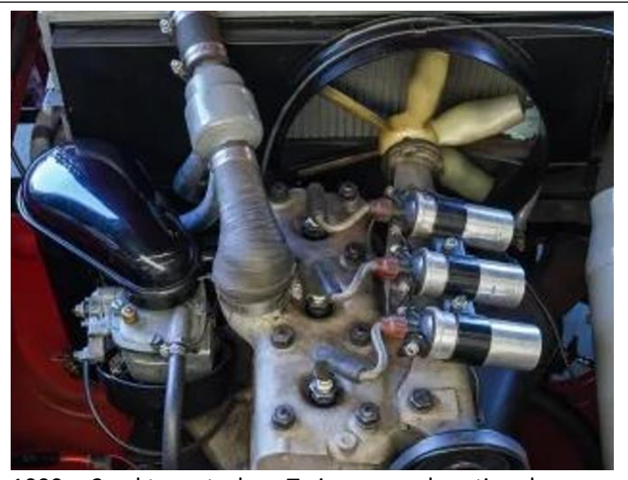
1000cc 3-cyl two-stroke. Twice as much optional.