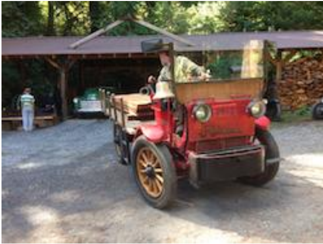
The 1912 Autocar