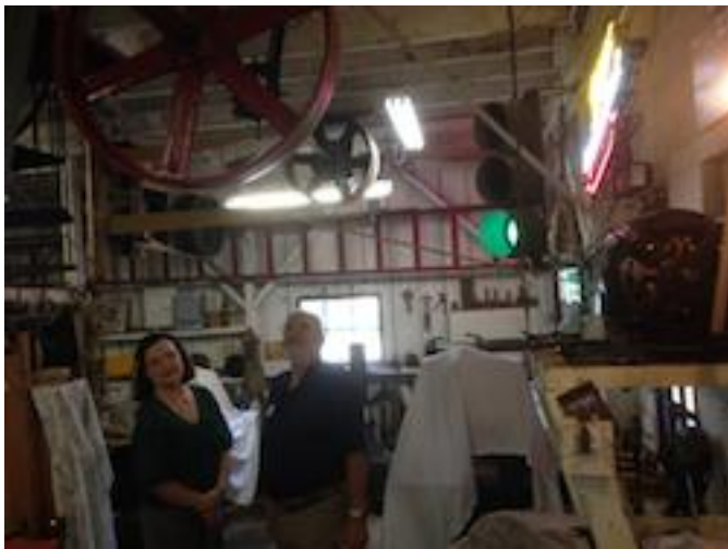
All the equipment runs on line shafts and belts.