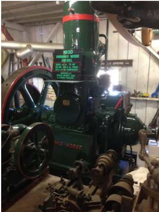
Some real nice machinery here