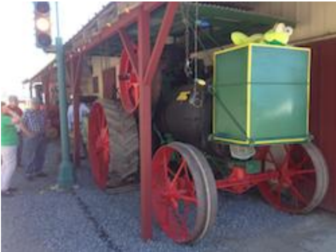
The recently restored steam tractor. Steering by Arm-strong.

(Editor: Plan on the second weekend of July if you want to see all of this stuff running on their "Power-up Weekend")