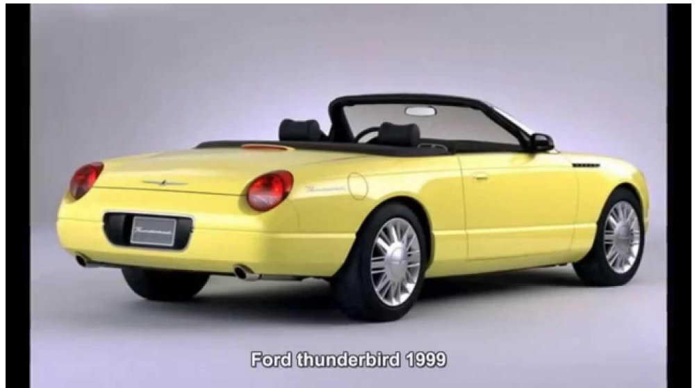
Ford thunderbird 1999

Another one of the concept Thunderbirds that Ford kept and is no longer around