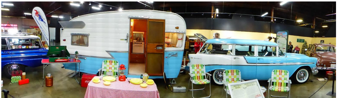
It's not a Tbird but not a bad way to travel. 1956 Chevrolet with a 1960 Shasta trailer.