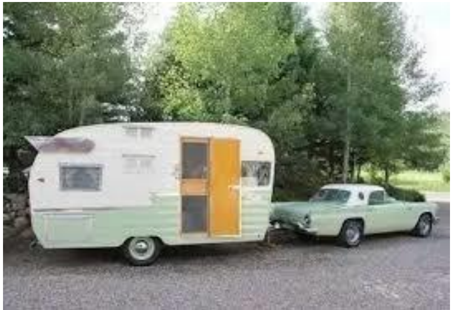
1957 Thunderbird with 1960's Shasta trailer