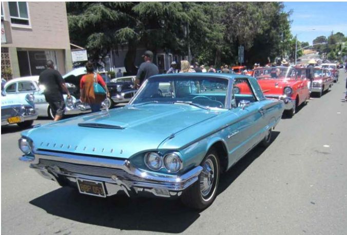
Vic's TBird waiting for it's Best Thunderbird award.

I know this one is not a Thunderbird but it is a very close sibling. The Lincoln Continental production line was right along side of the Thunderbird line.