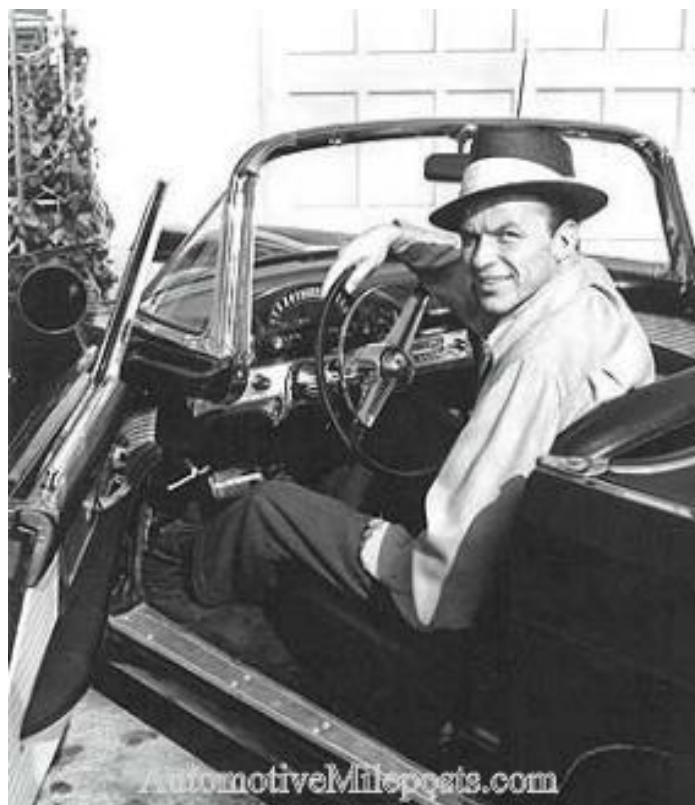
Taken while filming "The Tender Trap" in 1955. This was his 1955 black Thunderbird.

INSIDE FLIGHT LOG – PINOLE CAR SHOW MIGRATION 2016