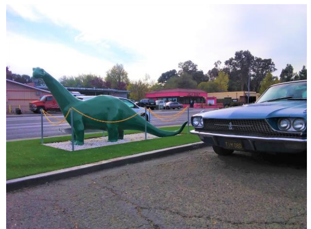
Texas Street, Fairfield

Later in the month we turned to Solano and Yolo counties on the hunt for Route 40 remnants. The linking of towns is evident here as Route 40 incorporated main drags through Fairfield, Vacaville, Dixon, and Davis. We saw no Lincoln Highway markers here, and there is controversy as to its route through this area.