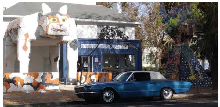
First St.. Davis