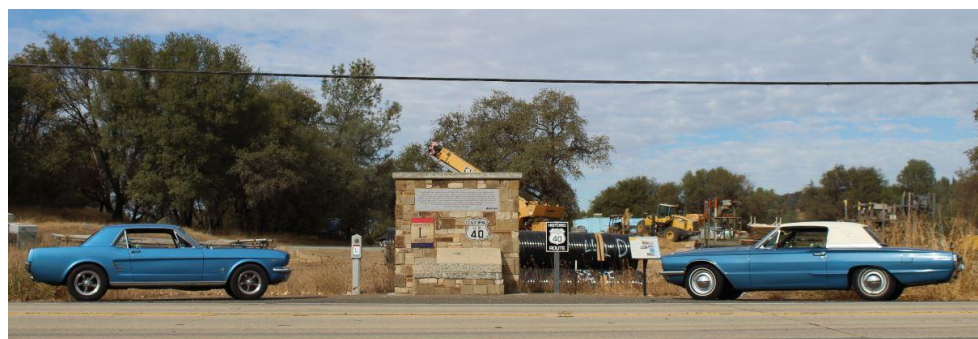
Lincoln Highway/Route 40 display near Newcastle