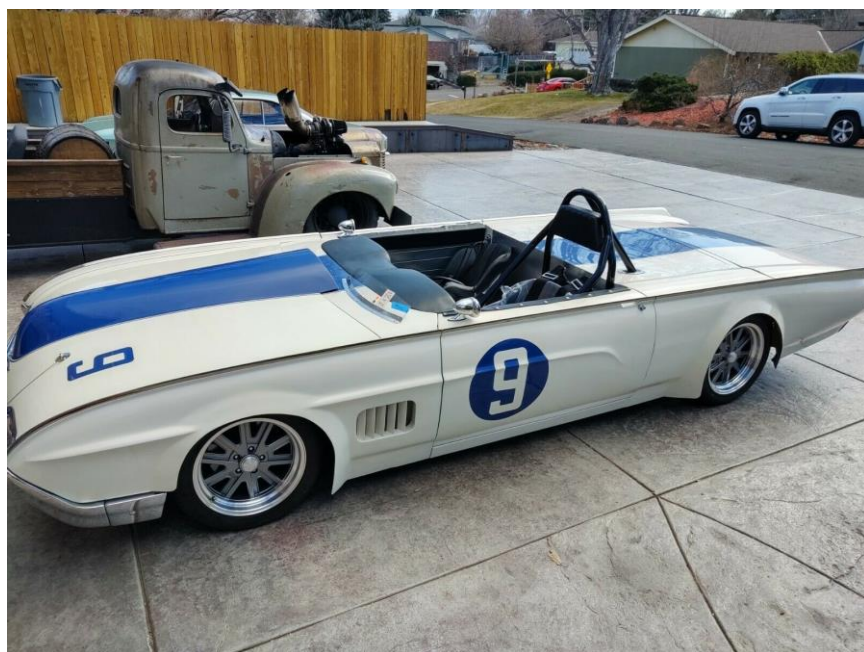
From eBay: 600 hp Lemans style race car. Sold for $35K.

INSIDE CLUB STATUS FOR 2012 REPORT FROM WISCONSIN MEMBER OF THE YEAR AWARD NOT MUCH!!! EXCEPT WE ARE LOOKING FOR VOLUNTEERS FOR 2021 OFFICERS