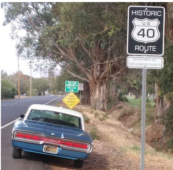
Solano College near Cordelia