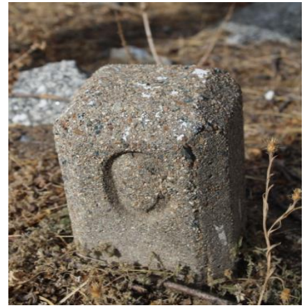
California "C" road markers that pre-date Route 40 can be found in Placer County.

Later in the month we turned to Solano and Yolo counties on the hunt for Route 40 remnants. The linking of towns is evident here as Route 40 incorporated main drags through Fairfield, Vacaville, Dixon, and Davis. We saw no Lincoln Highway markers here, and there is controversy as to its route through this area.