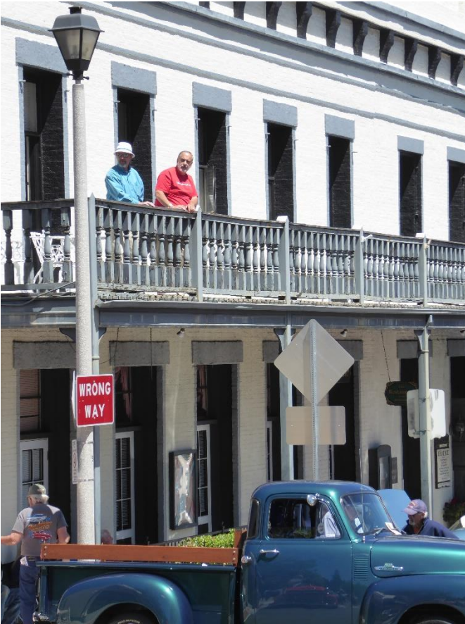
Grass Valley 2016