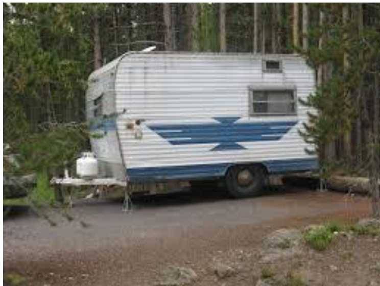
1963 Thunderbird Travel Trailer

Northern California Vintage Thunderbird Club