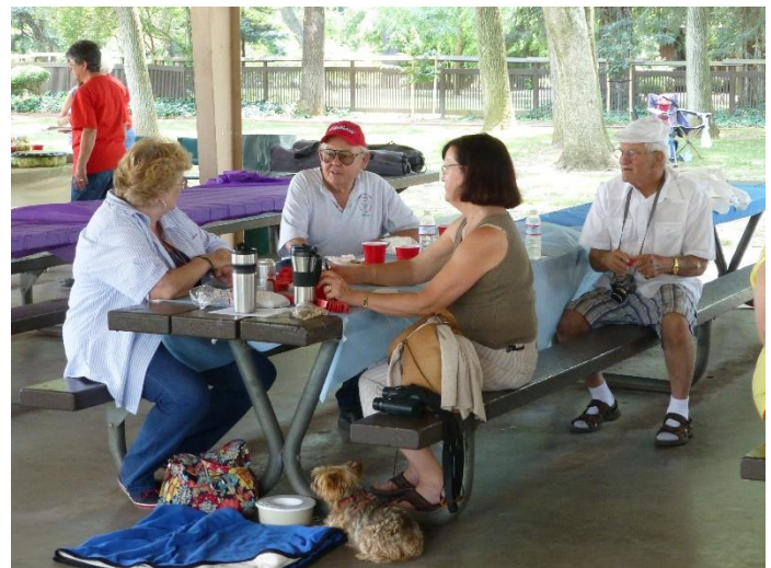
Horse and Feathers 2013