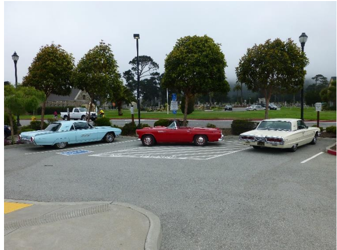
Colma Cemetery Tour 2013