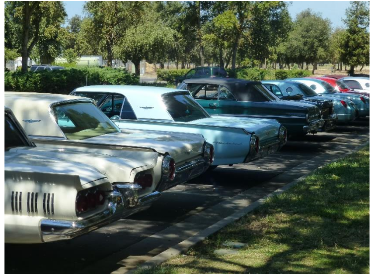
Horse and Feathers 2014