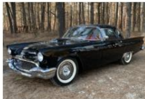
1957 Ford Thunderbird