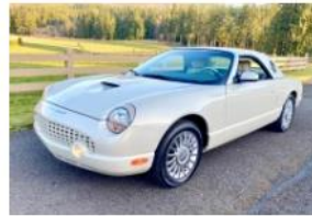
No Reserve: 1,900-Mile 2005 Ford Thunderbird 50th Anniversary