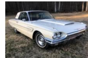
No Reserve: 1965 Ford Thunderbird