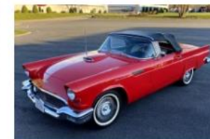
1957 Ford Thunderbird