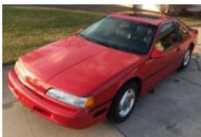
Ex-Jeff Gordon 1991 Ford Thunderbird Super Coupe 5-Speed