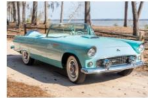
1955 Ford Thunderbird