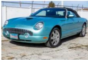
9,300-Mile 2002 Ford Thunderbird

Recently closed on Bring A Trailer online auction