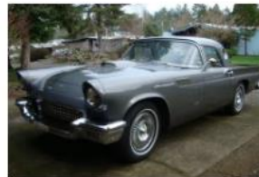
33-Years-Owned 1957 Ford Thunderbird