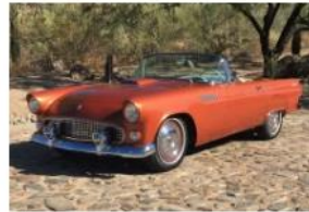
1955 Ford Thunderbird