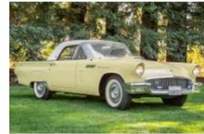
1957 Ford Thunderbird