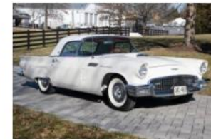
1957 Ford Thunderbird