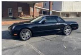
14k-Mile 2002 Ford Thunderbird