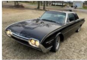
428-Powered 1962 Ford Thunderbird Coupe 6-Speed