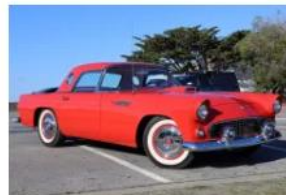
43-Years-Family-Owned 1955 Ford Thunderbird