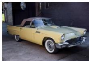
1957 Ford Thunderbird E-Code