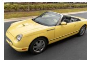
6,900-Mile 2002 Ford Thunderbird