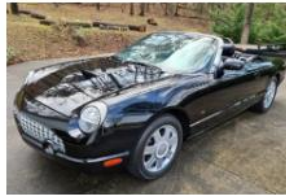
3,700-Mile 2004 Ford Thunderbird