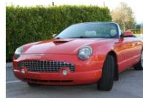
28k-Mile 2003 Ford Thunderbird 007 Edition