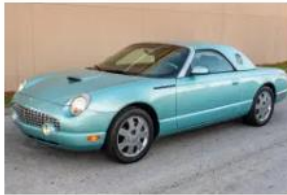
7k-Mile 2002 Ford Thunderbird