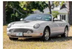
34k-Mile 2005 Ford Thunderbird